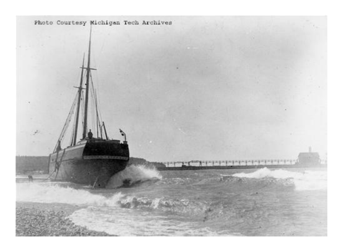
Colorado. 1898 September 19

Steamer. Flour on board. 19 persons on board and saved.