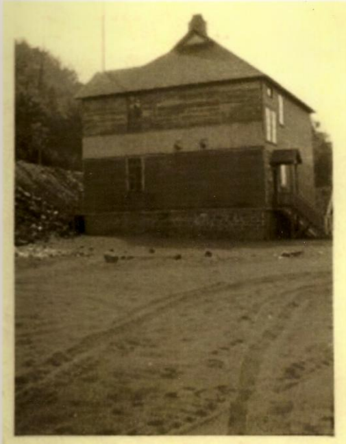
Michigan Smelts School - Looking West