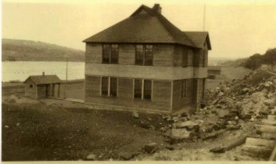
Michigan Smelts School - Looking East