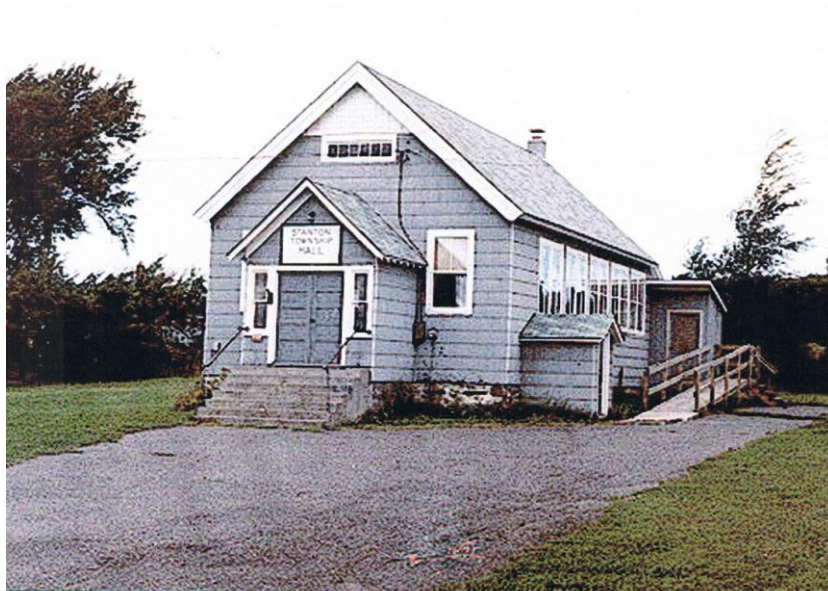
Liminga School now township hall.