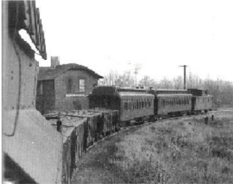
A rare photo of a CRRR school train at Mill Mine Jct. in June 1942, with coaches #53 and #56.