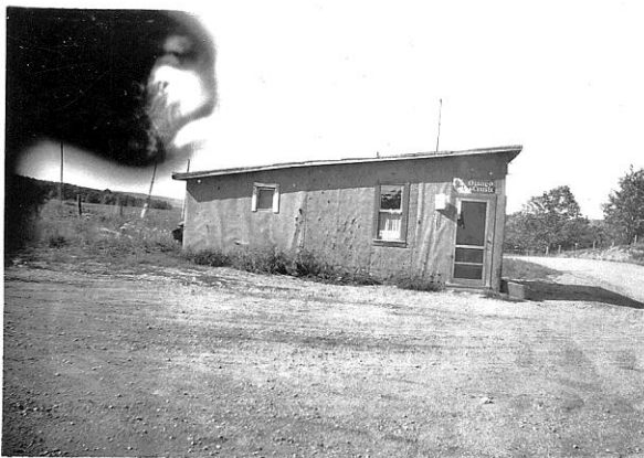
Schmidt Corner Bar.