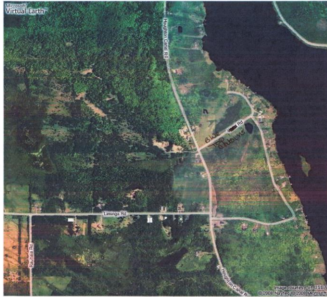
Schmidt's Corner Area.