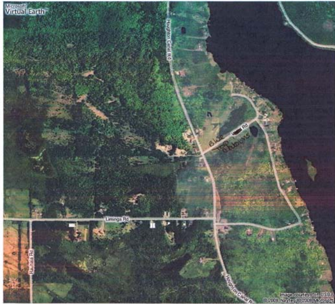
Schmidt's Corner Area.