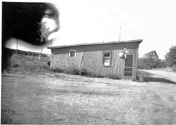
Schmidt Corner Bar.