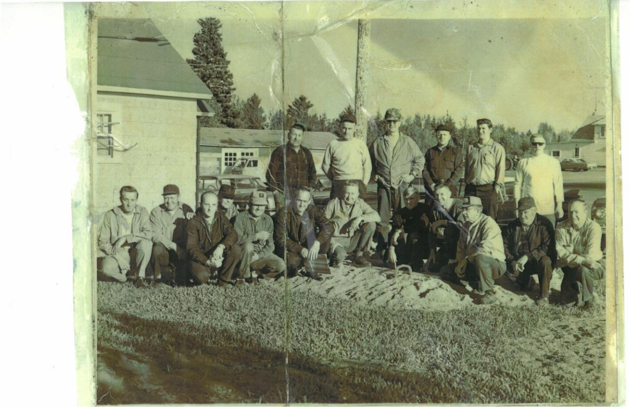
Stanton Horseshoe Team